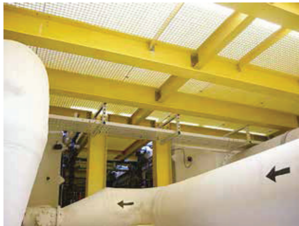
GRP I Beam &amp; column