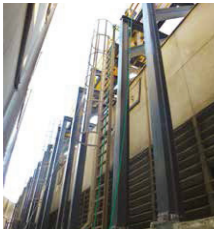
GRP column support