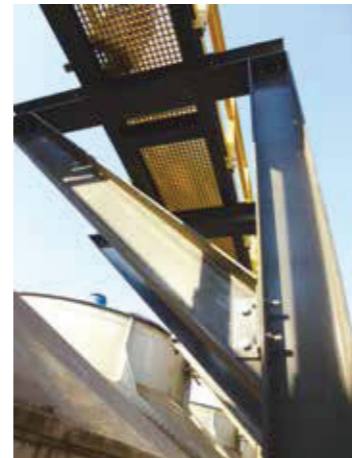
GRP cantilever system