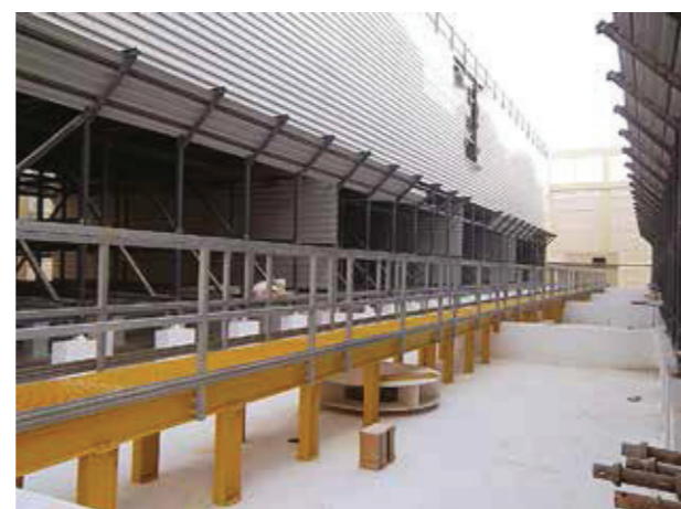
GRP Beam &amp; column

Our GRP Platforms are designed for various applications like District cooling plants, Sewage treatment plant, Power plant and Desalination plants. They replace the traditional steel epoxy painted or HDG platforms, which proved to have very short service life in such high corrosive environment. The structure is completely designed with GRP components like columns, beams, bracing and even FRP Bolts if required.