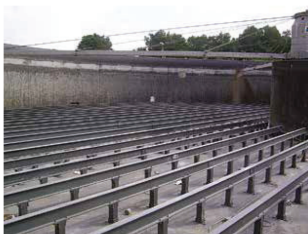
GRP H Beam structure